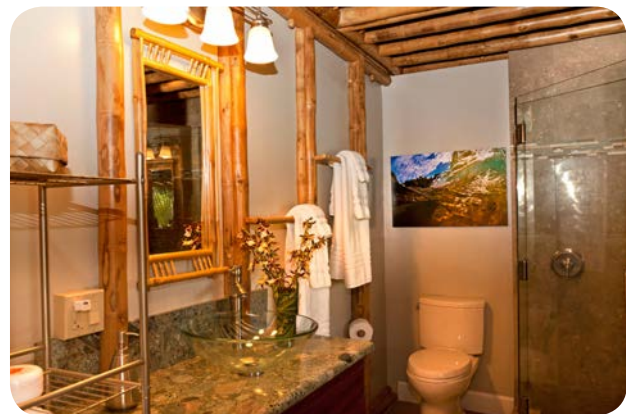
Master bath with beautiful exposed bamboo.