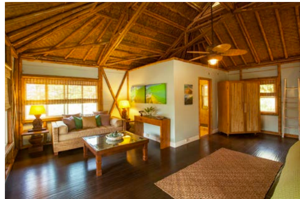
Signature Bali 576 living area and corner bathroom.