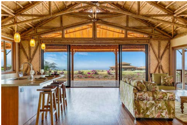
Hybrid Villa 1950 great room with split bamboo ceiling finish.