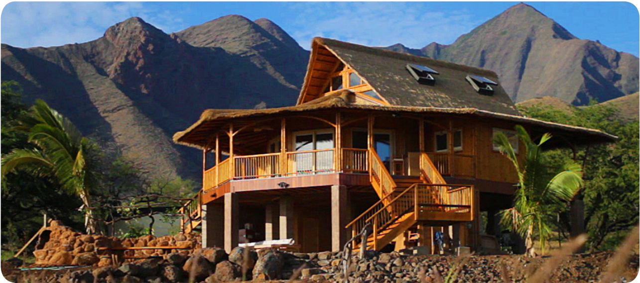
Signature Pacific 992 with synthetic thatch roofing and skylights, on post and pier foundation.