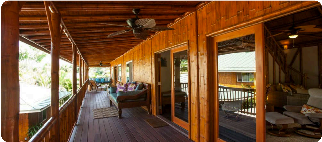
Signature Polynesian 1619 front porch with split bamboo exterior siding, bamboo porch posts, railing, and pickets.