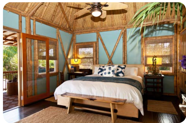
Master suite with woven bamboo ceiling and painted walls.