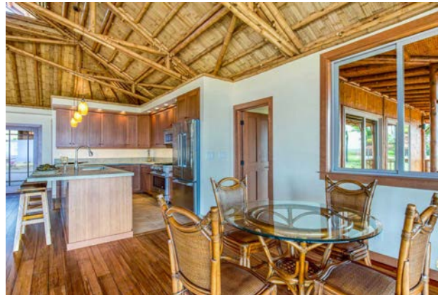
Hybrid Villa 1950 conventionally-framed walls with smooth interior.