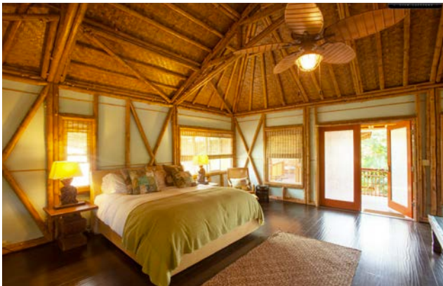
Signature Bali 576 woven bamboo ceiling finish with painted walls.