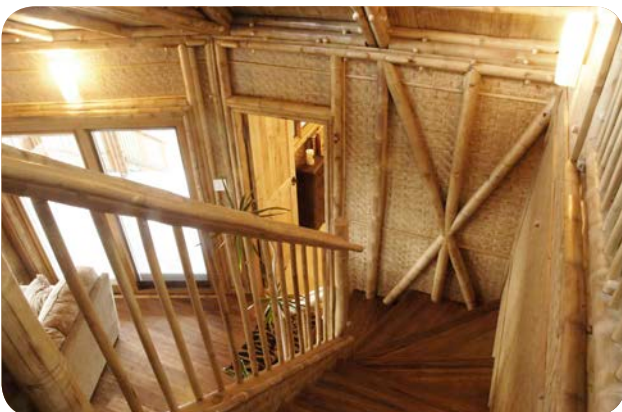
Stairway from loft with woven bamboo interior wall finish.