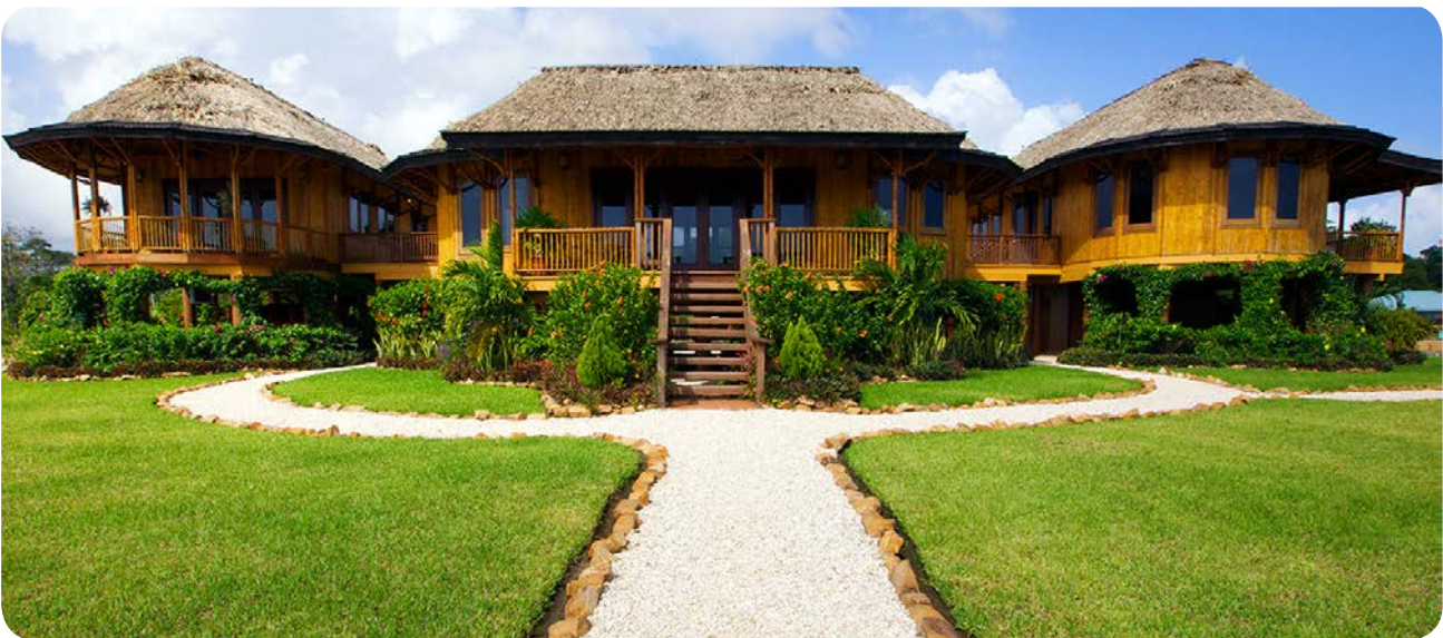
Signature Celestial 3 with thatch roofing.

Signature Home Packages are great for temperate climates with building codes that allow single-wall construction. Your package includes bamboo-framed exterior single-wall panels, complete with our natural split bamboo exterior siding. Select your interior wall finish, either: paint color of your choice, woven bamboo, or split bamboo, and enjoy beautiful exposed bamboo throughout.