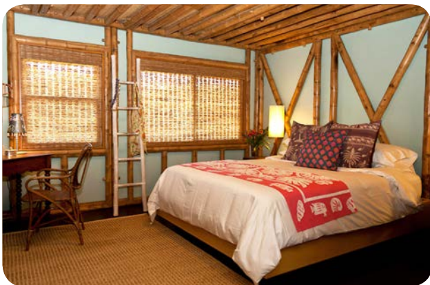
Guest bedroom with exposed bamboo x-braces.