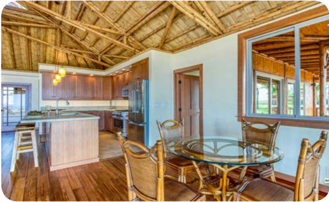
Hybrid Villa 1950 - conventional walls with split bamboo ceiling finish.