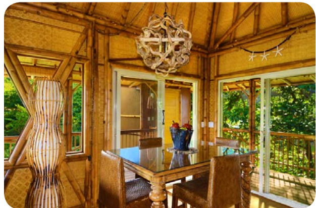
Dining area with exposed bamboo x-braces and trusses.