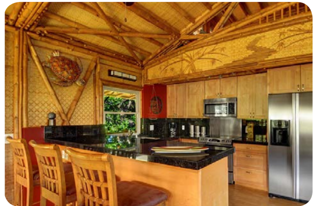
Kitchen with custom bamboo artwork above cabinets.