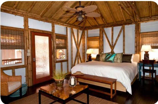
Signature Zen 400 studio with woven bamboo ceiling.