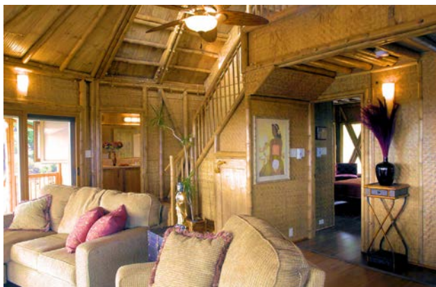
Signature Pacific 992 living area with split bamboo ceiling finish.