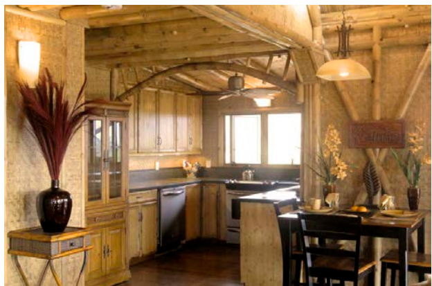
Signature Pacific 992 kitchen with woven bamboo wall finish.