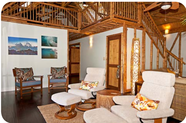
Painted walls with bamboo ceiling and stairway to loft.