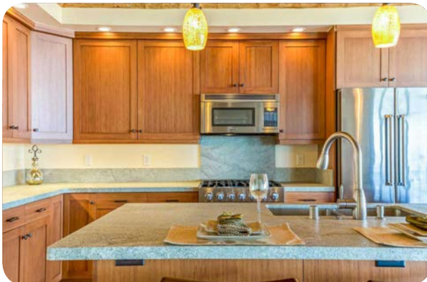
Contemporary, spacious kitchen with high-end finishes.