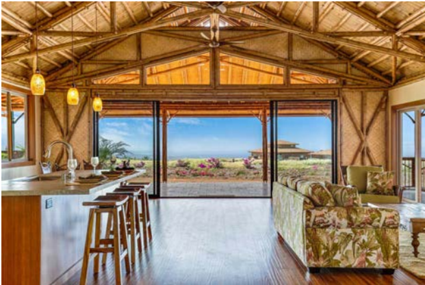
Hybrid Villa 1950 great room with split bamboo ceiling finish.