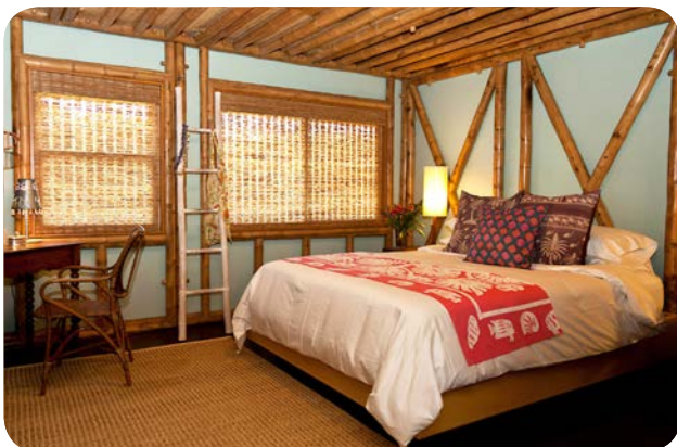
Guest bedroom with exposed bamboo x-braces.