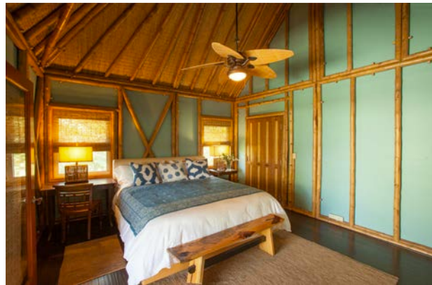
Signature Poly 1619 bedroom with woven bamboo ceiling finish.