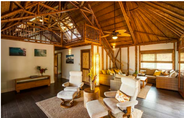
Signature Poly 1619 with woven bamboo ceiling and painted walls.