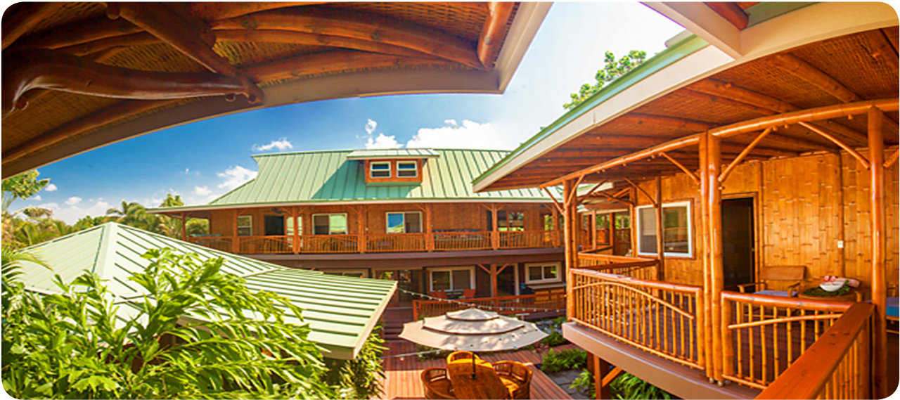
Multi-unit luxury vacation rental property comprised of four Bamboo Living structures connected by walkways.